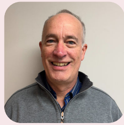
Dane - 1 year